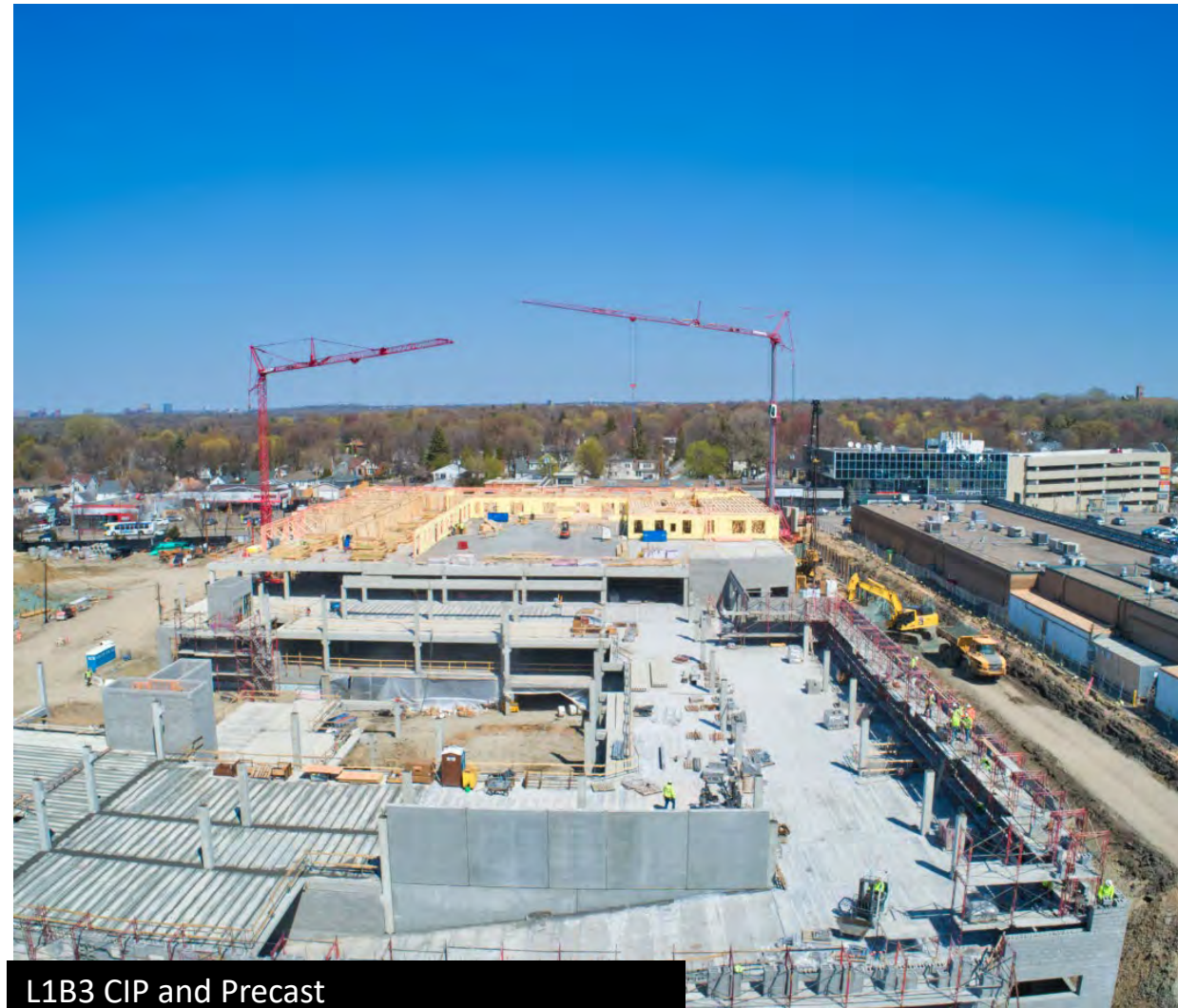
L1B3 CIP and Precast