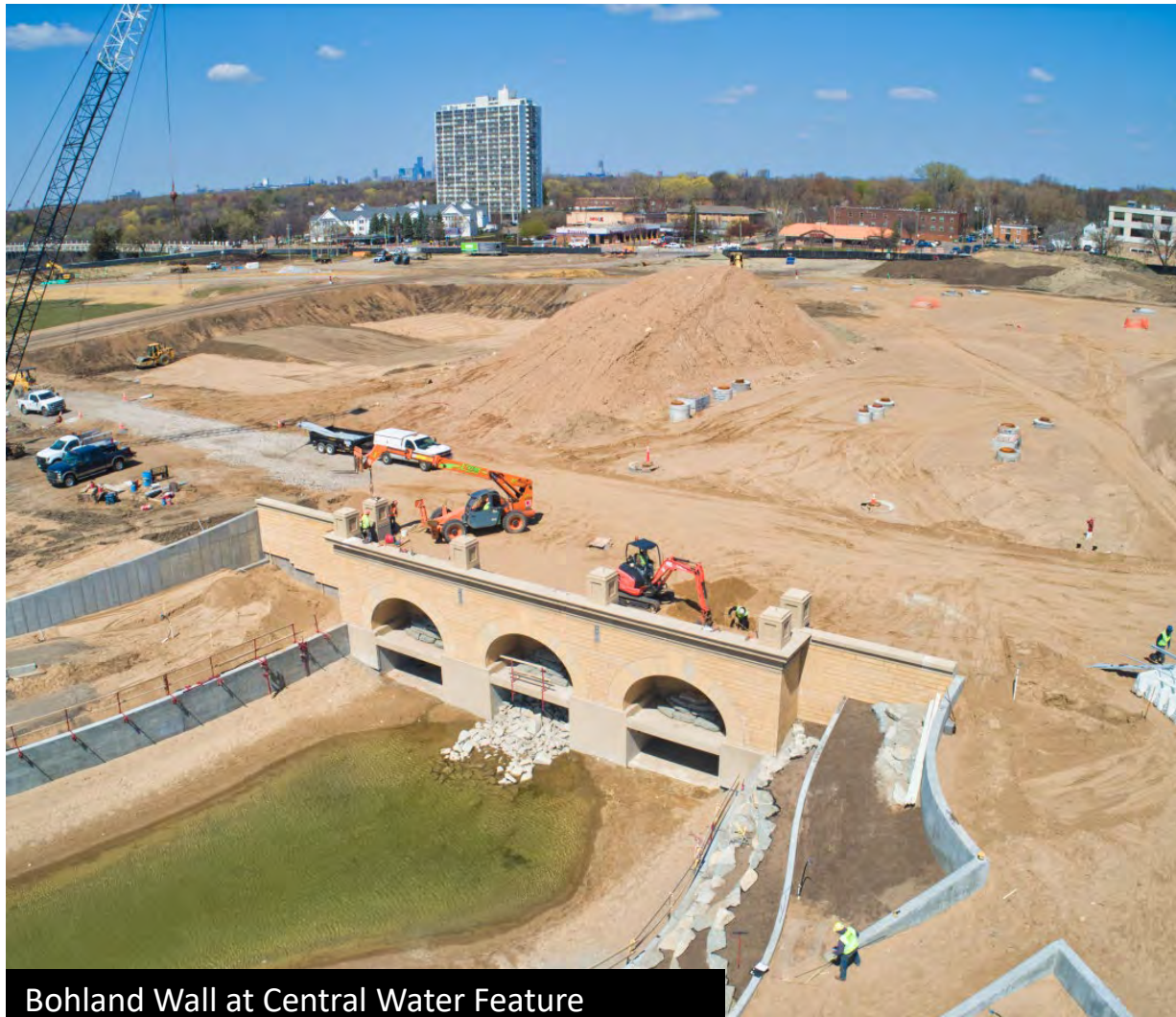
Bohland Wall at Central Water Feature