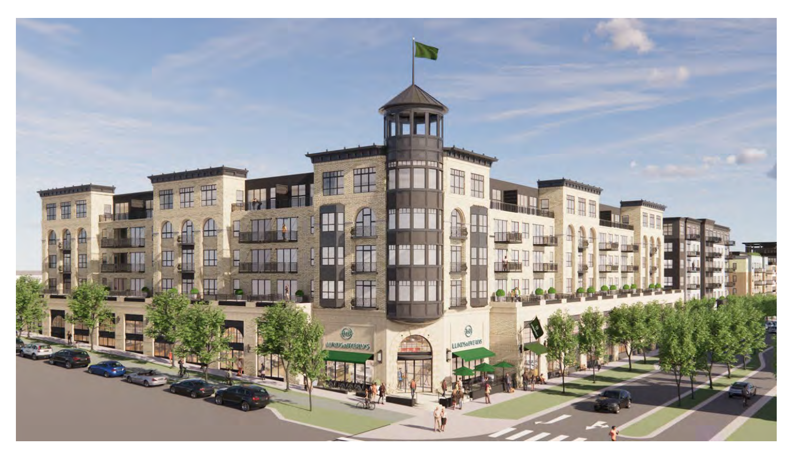
Block 3 Lot 1- Weidner Apartment Homes